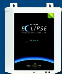
Total Eclipse™ 2 & 4